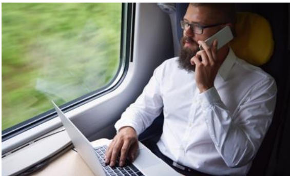
Image: A passenger enjoys a Connected Journey ( View Full Resolution )